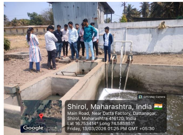
Site Visit To – Sewage Treatment Plant, Shirol