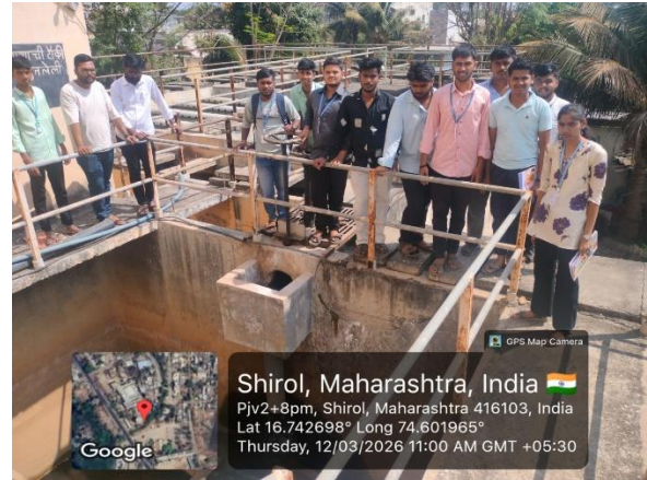
Site Visit To – Water Treatment Plant, Shirol