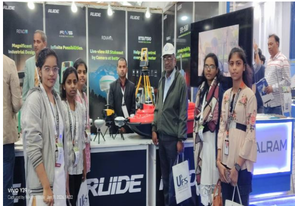
Visit To – Constro 2k26, Pune